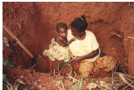
Figure 5: A miner and her child in Ghana

Children are typically the responsibility of their mothers. At many mine sites, women work with young babies tied to their backs and toddlers at their side (Figure 5). In cases where alternative childcare or schooling is unavailable or additional supplementation of income is needed, older children accompany women in artisanal mining activities, and often participate. In accordance with this, the health and safety risks faced by children depend on the type of mineral exploited, the techniques employed, and whether these activities take place in the home (e.g. in the kitchen) or at a mine site.