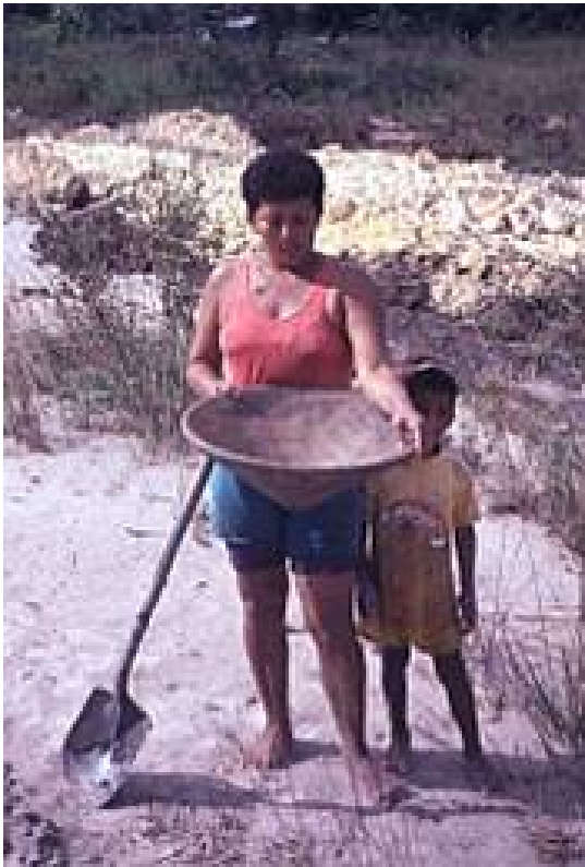
Figure 7: Venezuelan Women and a Wooden "Batea"

In cases where processing activities take place closer to home, the construction of on-site mills could markedly reduce time and effort dedicated to carrying ore. A modification such as this, however, may be less attractive to women simultaneously conducting child care or when security issues are of greater concern. The state of existing machinery may also influence women's burden of work. In the Makate district of Tanzania, improved functioning of grinding mills considerably benefited women by reducing the tonne/km load by more than 90 per cent (Everts, 1998). Although the mill was applied in an agricultural context, this lesson is readily transferable to artisanal mining.