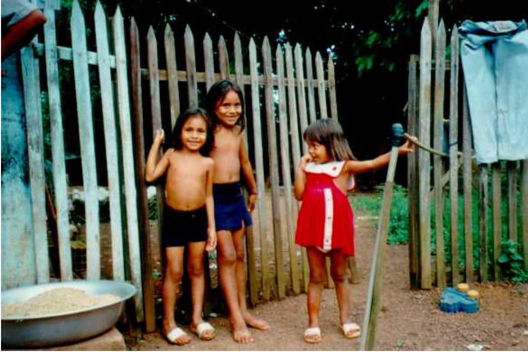
Figure 3: Girls in an established Brazilian mining community – high hopes but limited opportunities

exposures, can further exacerbate the potential for injury or illness; thus, the cycle of ill health and poverty is perpetuated.