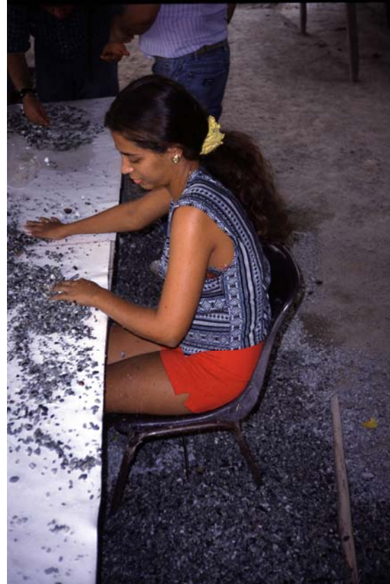
Figure 2: Women handpicking emeralds in Campos Verdes, Brazil

becomes head of the household due to death or abandonment of a spouse, men typically maintain control of finances in family mining operations.