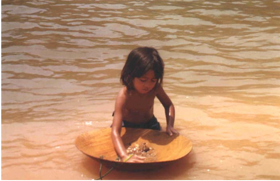
Figure 1: Young girl engaged in mining in Lao PDR

this is powered mostly by women at the far end of the raft. North of Hatkhe in Nam Ou, female workers predominate in gold mining and more than 80 percent of the workforce (approximately 100 people) consist of girls aged between five and 12, working under extremely harsh conditions, typically under adult supervision (Figure 1).