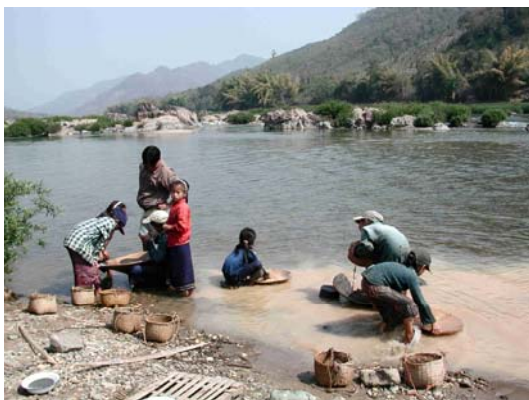
Figure 4: Children Engaged in Panning in Laos

Bolivian Altiplano is barely 48 years (Quiroga, 2000), an overwhelming difference from the national average of 63 years (World Bank, 2002). In Lusaka, Zambia, women are illegally involved in the manual crushing of marble, and face a high potential for developing pneumoconiosis (Dreschler, 2001). Crushing and grinding can be accomplished using a number of mechanical means (e.g. hammer mills) or manual techniques, such as a mortar and pestle. When the degree of mechanization is low, women are more likely to predominantly be engaged in this activity.